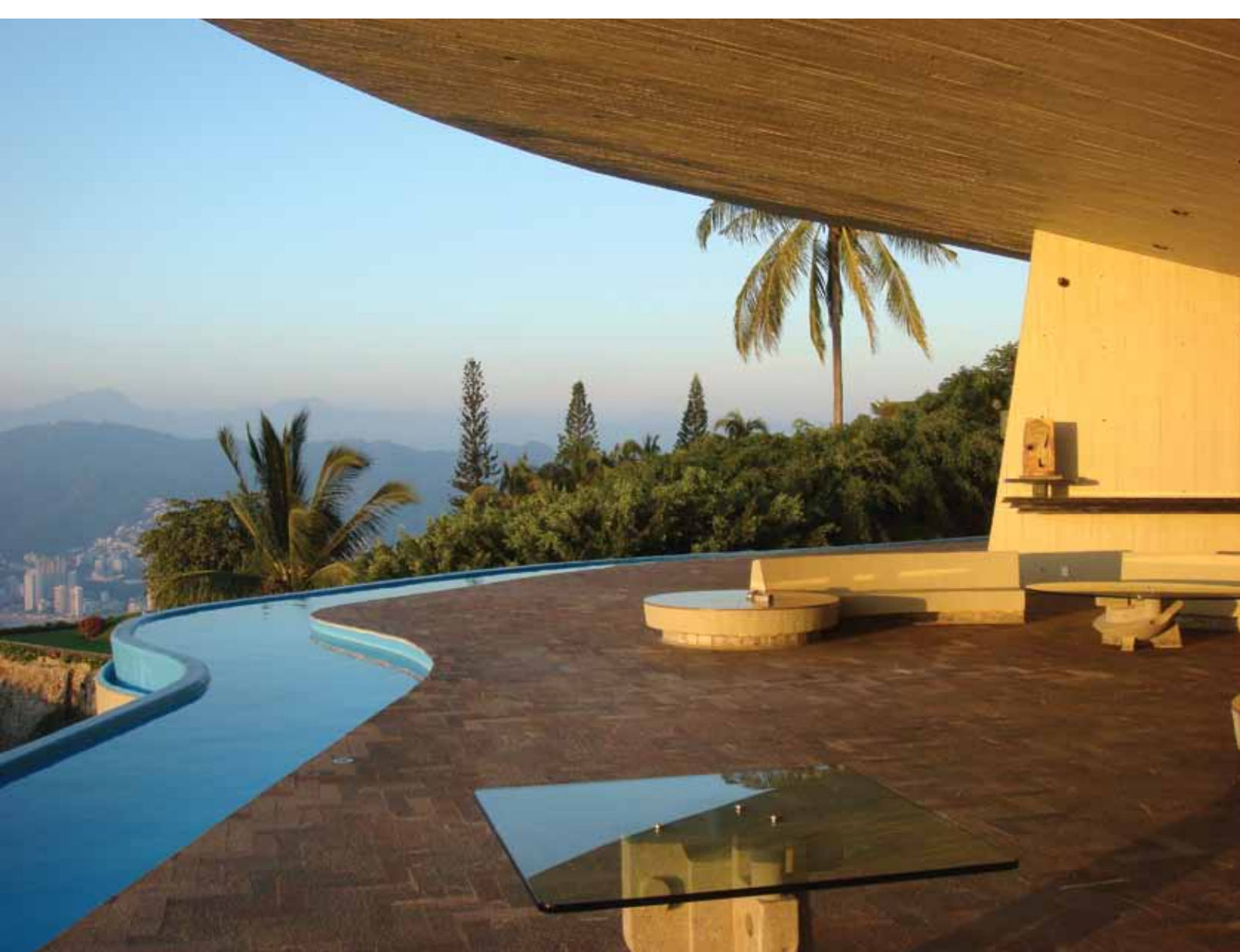
Lautner's showiest commission may have been a 25,000-square-foot residence named Marbrisa, which he surrounded with a swimmable "sky moat."

Alaska, Colorado, and Florida. Three of his most recognized commissions are the Malin residence/"Chemosphere" (Hollywood, 1960); the Garcia residence (Los Angeles, 1962); and the Sheats-Goldstein residence (Beverly Hills, 1963/1989). These buildings, among others, have been featured in major Hollywood films and continue to challenge commonly held notions of residential design.