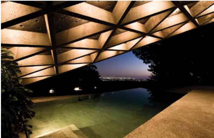
Above: A coffered roof shades part of the terrace and pool at the Sheats-Goldstein residence. Below: The Garcia house demonstrates Lautner's ability to mold concrete into unconventional forms.